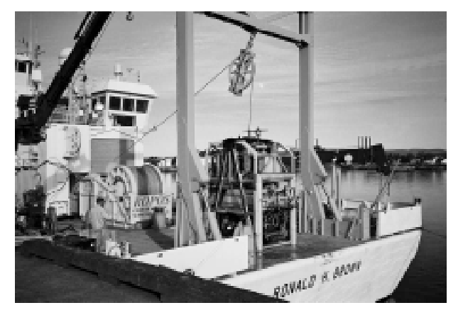
ROPOS remote operating vehicle on stern of NOAA RV Ronald H. Brown

the degree to which human technology is responsible for declining ocean fish populations."