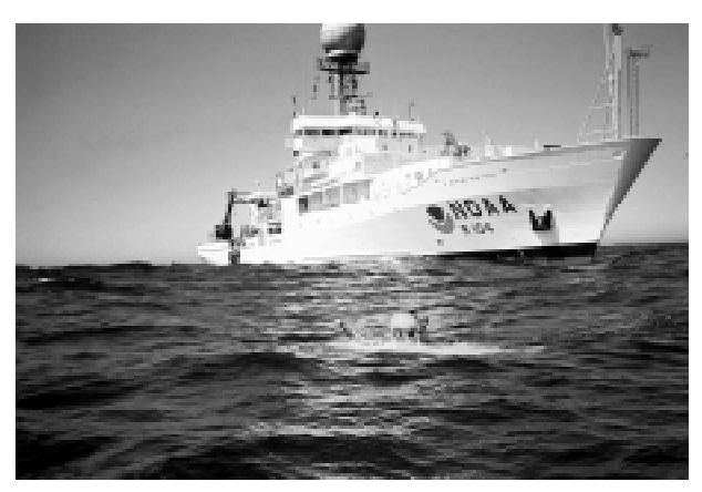
NOAA RV Ronald H. Brown with ROPOS remote operating vehicle in foreground

study team will rely on the NOAA ship Ronald H. Brown and a variety of remote data collection vehicles to detail the topography and biological composition of the Canyon and to collect specimens. The cruise will be staged from Victoria, BC, Canada, and end in Astoria, Oregon. Allowing for rough terrain and sample collection, the team intends to make about 15 transects of the canyon walls and floor. The explorations will cover approximately 40 km along the upper part of the Canyon, ranging at depths of 200 to 2,000 meters (650 – 6,560 feet).