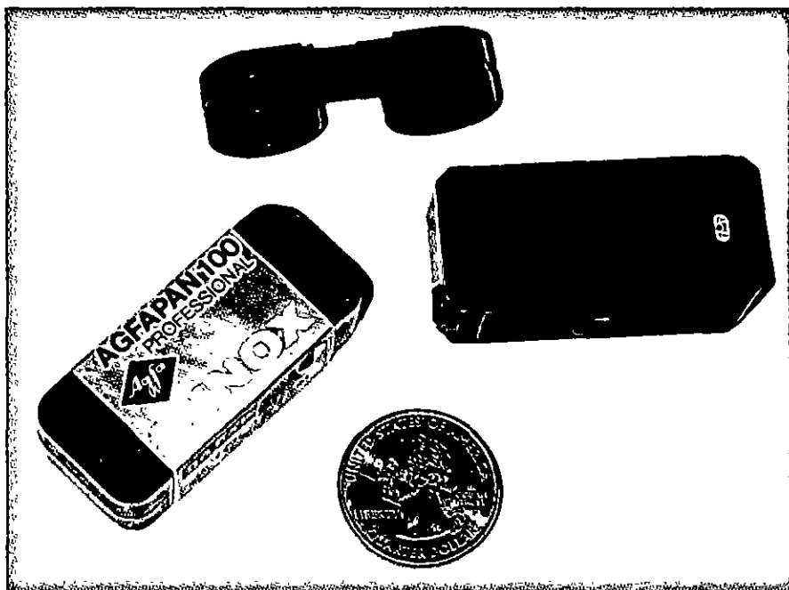
Subminiature camera, not much larger than its film cassette, use in for document copying or cite casing photography.

In February 1979, after several exchanges of messages with CIA headquarters regarding the type of communications to be used in this case, a deaddrop was put down for Tolkachev containing a small spy camera, a light meter, camera instructions, and an operational note, all concealed in another "dirty mitten." The spy camera was matchbox-sized and had been fabricated by OTS so that