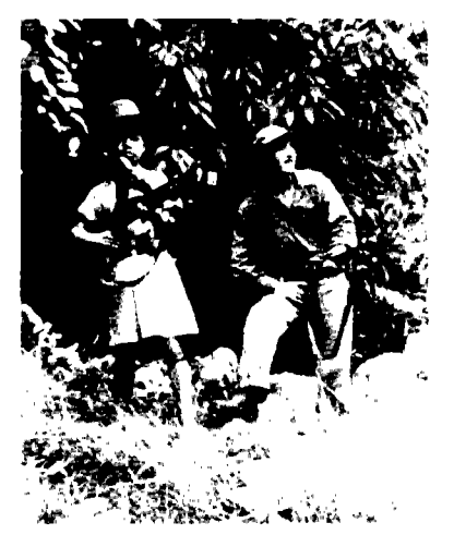
Two Kachin guerrillas supporting Detachment 101 in Burma.