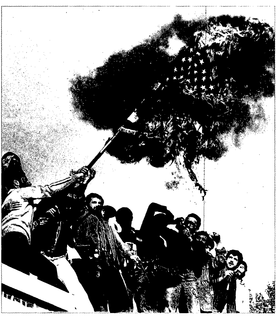
Iranian demonstrators burn American Flag on wall of US Embassy shortly after takeover by militants in November 1979.