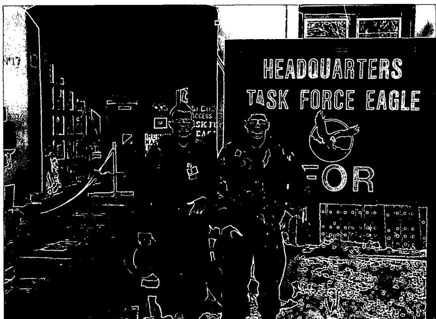
NIST members in front of Task Force Eagle Headquarters (author is on right). March 1996.

“Balkans analysts’ VTC,” as it became known, has taken place on a weekly basis since January 1996 and is hosted by the Director of Central Intelligence’s Balkan Task Force.