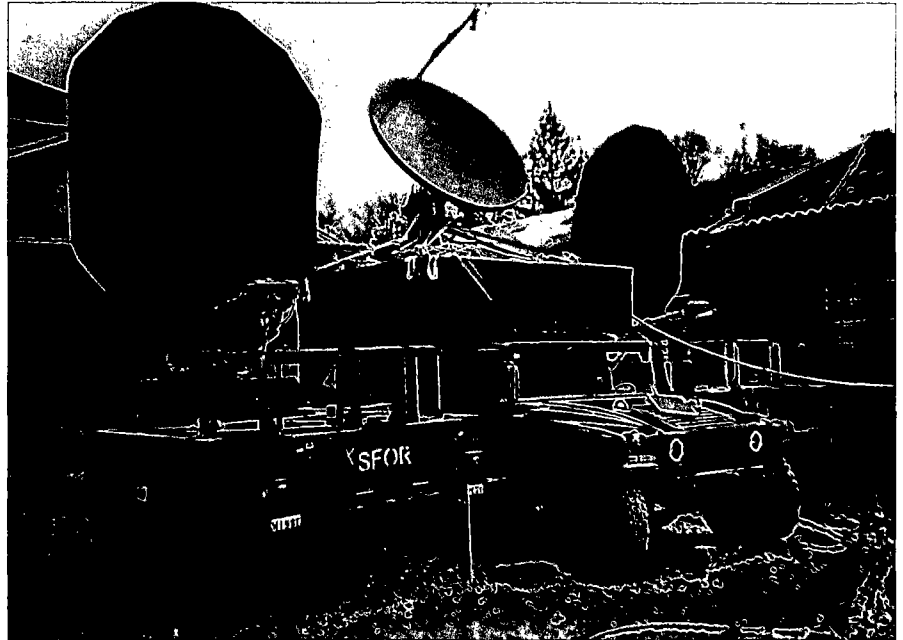
NIST communications equipment, February 1998.

To ensure that NISTs are used according to joint doctrine, an educational program is required. The NIST program management office should conduct frequent visits to each of the Unified and sub-Unified Commands to train the theaterers on the program. In addition, it should participate in theater exercises more often by deploying smaller teams to limit cost. During the exercises, the team could demonstrate various functions by managing time-sensitive RFIs, providing unique intelligence products, and so forth. Another educational practice that should be developed is hosting