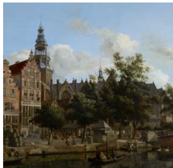
above: Pieter de Hooch, Courtyard Scene in Delft (detail), 1658, oil on canvas mounted on panel, Private Collection

The family concerts are made possible in part by the generous support of a National Gallery of Art school docent.