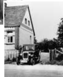
This old Opel car was used by the Kusserows when they traveled house to house handing out religious tracts. The painted sign on the side of their house in Bad Lippspringe, Germany, reads "Lesen Sie das Goldene Zeitalter" ("read The Golden Age").