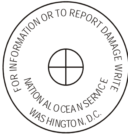
National Ocean Service General Usage Disk