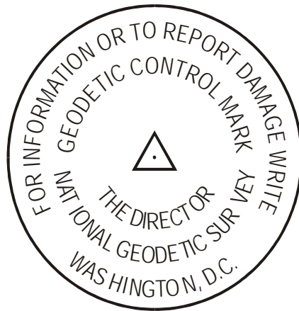
National Geodetic Survey New Geodetic Control Disk