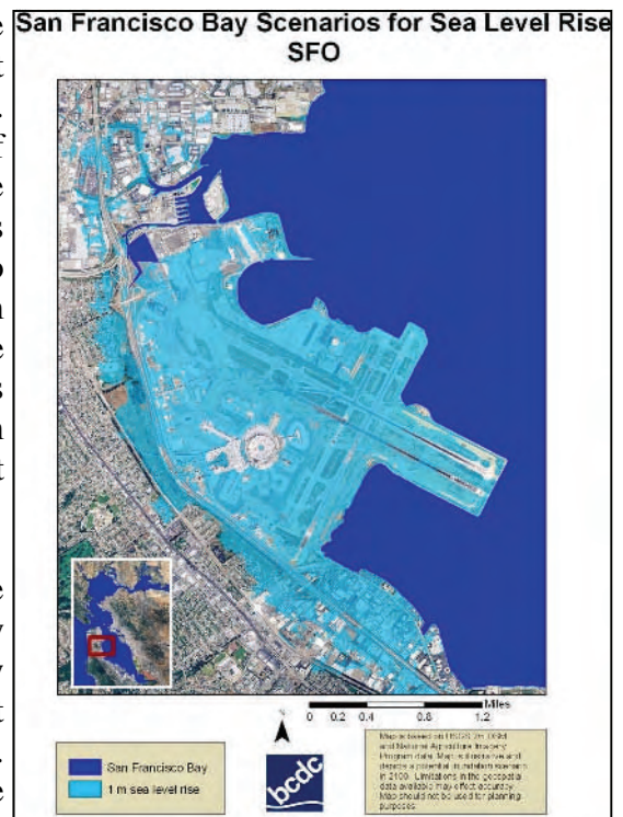
Map depicting area flooded by a one meter sea level rise near San Francisco Airport.