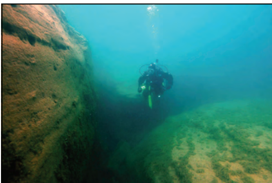
A diver explores ancient shoreline in Thunder Bay, Michigan.

The Great Lakes have undergone substantial changes since their creation from melting glaciers nearly 14,000 years ago. At one point, the Lakes' water levels were nearly 400 feet lower than they are at present, and a limestone land bridge joined the area around Alpena, Michigan to the base of Ontario's Bruce Peninsula, effectively dividing Lake Huron's predecessor into at least two separate basins. Conifer forests grew on lands now far beneath the surface of the lake, and the submerged forest remains provide organic carbon useful for dating prehistoric lake levels.