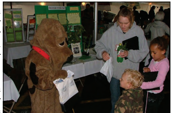
RSPT's mascot Rex the Dog hands out waste bags to remind kids to clean up after their pets.

In addition, the RSPT launched a robust public outreach campaign to increase the public's awareness of stormwater and the steps they can take reduce polluted runoff. The campaign has consisted of radio and television public service announcements (PSAs), print materials, community