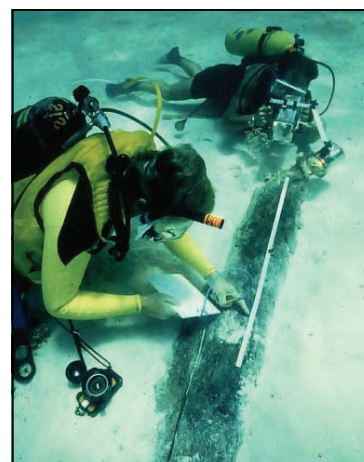
Divers measure a section of the 'Infante', one of the 13 ships of the Spanish Plate Fleet.

In 1733, thirteen ships of the Spanish Plate Fleet were sunk along 80 miles of the Florida Keys during a hurricane. These shipwreck sites represent some of the oldest artificial reefs in North America, supporting a complex assemblage of marine life. To preserve this significant historical coastal resource, the Florida Department of State, Bureau of Archaeological Research received a subgrant from the Florida Coastal Management Program (FCMP) to explore, document and assess the sunken vessels in order to establish the foundation for a multiple property nomination to the National Register of Historic Places. The FCMP funds also supported the design and printing of an interpretive guide booklet and website development. The nomination was successful, and the National Park Service listed the 1733 Spanish Plate Fleet in the National Register in June 2006. Other programs benefiting from this subgrant include Florida Keys National Marine Sanctuary, Biscayne National Park, Florida Park Service and the National Register of Historic Places.