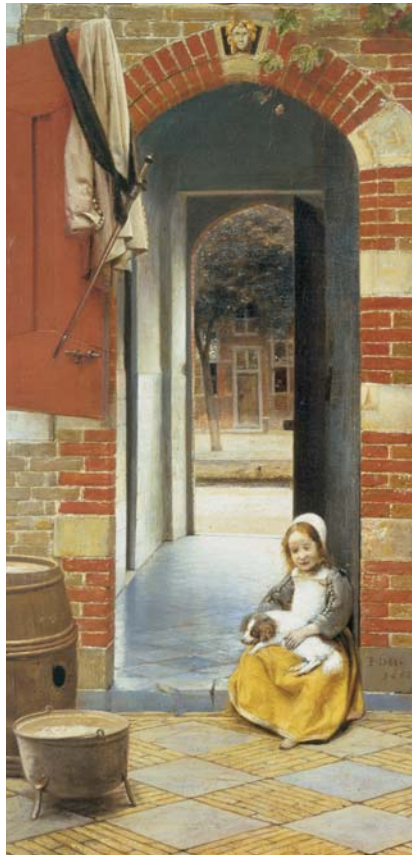
Pieter de Hooch, Courtyard Scene in Delft (detail), 1658, oil on canvas mounted on panel, Private Collection

Join us for a weekend of programs celebrating seventeenth-century Dutch painters and the places that inspired them.