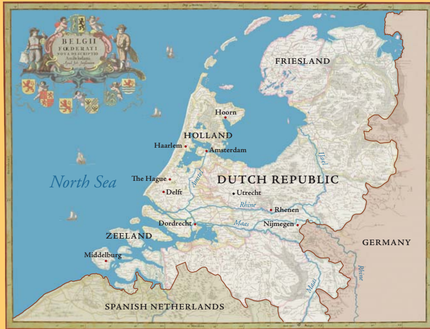
Map of the Dutch Republic, adapted from the map by Johannes Janssonius, 1658.

PRSRT STD U.S. Postage PAID ROCHESTER, NY PERMIT NO. 1434