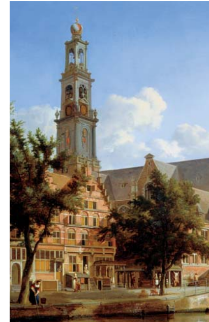
Jan van der Heyden, The Keizersgracht and the Westerkerk in Amsterdam (detail), c. 1667–1670, oil on panel, Eijk and Rose-Marie van Otterloo

Create your own Dutch cityscape using rubber stamps and colored pencils. Decorate your scene with stamps inspired by the unique architecture of canal homes, then draw in the sights, sounds, and activities that will bring your seventeenth-century neighborhood to life. For inspiration, we recommend that you tour the exhibition first.