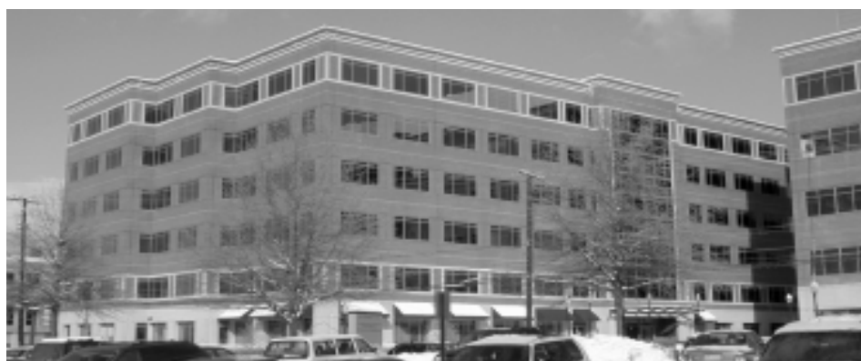
A view of NIAAA's new home at 5635 Fishers Lane in Rockville, Maryland. To the right is the corner of 5625 Fishers Lane, the building that will house the NIAAA intramural program.

However, for Fed-Ex, UPS, and deliveries, it should be noted that the city and zip are Rockville, MD 20852 .