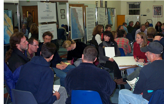
Sanctuary Advisory Council Members participate in a public meeting as part of the Joint Review Management Plan in California.

Sanctuary Advisory Councils provide advice about sanctuary operations and projects, including education and outreach, research and science, regulations and enforcement, and management planning. They are particularly critical in helping a sanctuary during its designation or management plan review process. Sanctuary Advisory Councils may establish additional working groups and subcommittees to help get their work done; working groups and subcommittees meet throughout the year. The most common working groups and subcommittees are those for conservation, education and research. Often working groups are created to help address a specific issue or project, and are disbanded after their missions have been accomplished. Council members provide expertise on both the local community and sanctuary resources, strengthen connections with the community, and help build increased stewardship for sanctuary resources.