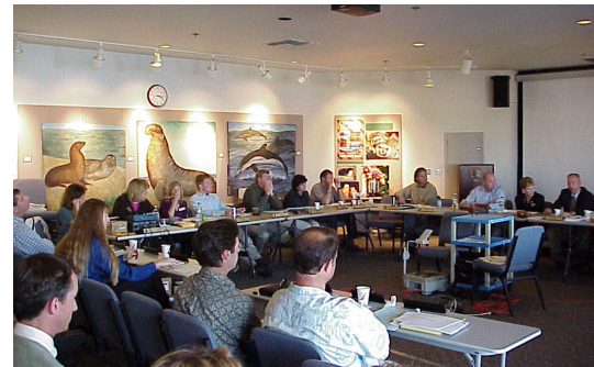
A Channel Islands Sanctuary Advisory Council meeting.

Approximately 425 individuals (members and alternates) serve on sanctuary advisory councils. The members and their working groups volunteer approximately 25,000 hours of their time each year.