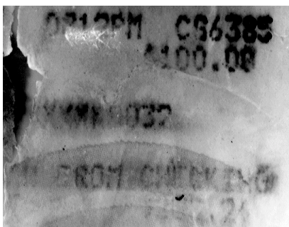
ATM receipt evaluated by the FSL using digital imaging.

in a pretrial hearing where the defendant motioned to suppress the FSL analysis in this death penalty murder case. The judge denied the defendant's motion. When the defendant was again confronted with the TIGTA laboratory report, he admitted to his involvement in the crime, and implicated the second defendant, the victim's nephew, as the one who committed the murder. The defendant pled guilty to third degree murder and the nephew pled guilty to first degree murder.