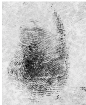
Developed latent print on threat letters.