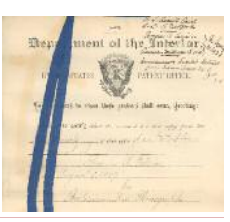
Exhibit: Morrow, GA From Sacred Harp to Elvis: Music in the Archives