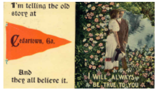
Inmate's Postcard

Federal Hall, New York City New York: An American Capital