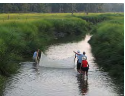
Office of Ocean and Coastal Resource Management National Ocean Service National Oceanic and Atmospheric Administration