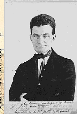
John Brown circa 1850