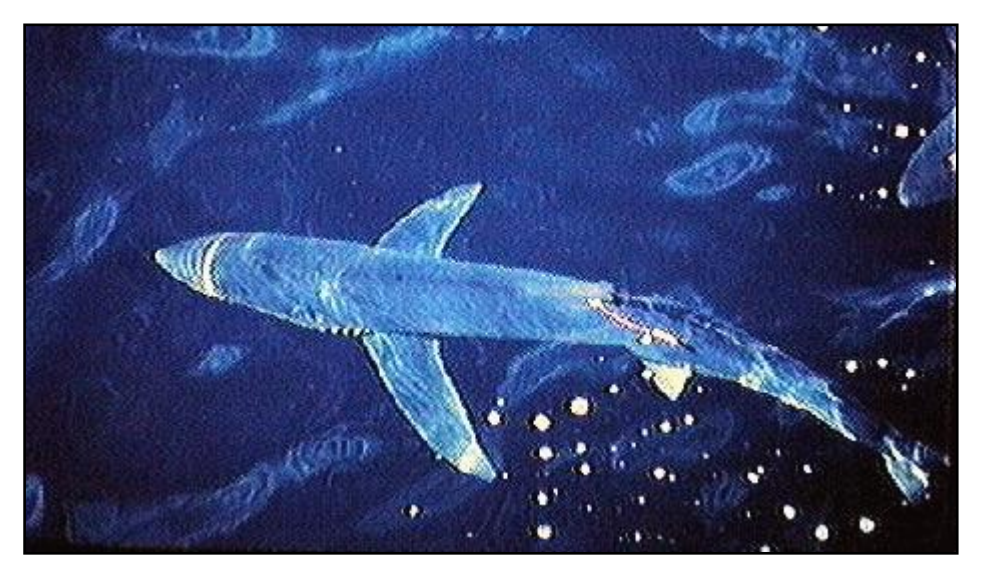
Blue shark ( Prionace glauca )

The next meeting to discuss options for a CMS shark instrument was set to occur in December 2008, immediately following the Ninth Conference of the CMS Parties in Rome. The United States remains hopeful that these efforts will produce a new international instrument that can advance and add value to endeavors to improve the conservation and management of migratory sharks.