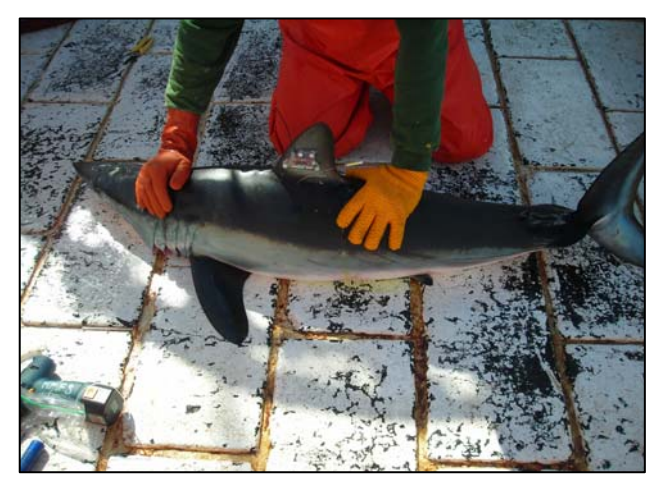
Shortfin make tagged by NEFSC biologist with a satellite (SPOT) and CSTP dart tag on a commercial longline vessel.

The primary objectives of the new technology tag studies are to examine shark migratory routes, potential nursery areas, swimming behavior, and environmental associations. Secondarily, these studies can assess the physiological effects of capture stress and post-release recovery in commercially and recreationally captured sharks. NEFSC electronic tagging studies include: 1) acoustic tagging and bottom monitor studies for coastal shark species in Delaware Bay and the USVI as part of COASTSPAN; 2) tracking of porbeagle sharks with acoustic and PSATs in conjunction with the MDMF; 3) placing PSAT and SPOT tags on dusky and tiger