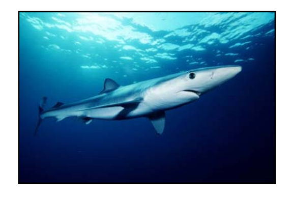
Blue shark swimming off southern California.

Overall, compared to the years before enactment of the Shark Finning Prohibition Act, great strides continue to be made in shark conservation, data gathering, management, research, and education on a national and global scale that will contribute to sustainable management of sharks. For current information on shark management, go to www.nmfs.noaa.gov.