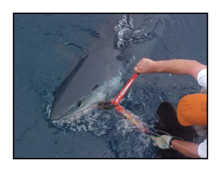
A large shortfin make shark being released after capture and tagging during the SWFSC juvenile shark abundance survey.