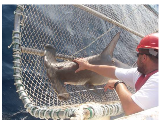
Scalloped hammerhead captured in the Gulf of Mexico during a bottom longline survey.

to satisfy five important assessment principles: stockwide survey, synopticity, well-defined sampling universe, controlled biases, and useful