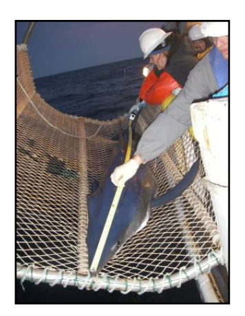
Shortfin mako being measured

Another ongoing cooperative study is on the post-release survivorship, habitat utilization, and movement patterns of porbeagle sharks captured on longline gear in the North Atlantic using PSAT tags. One of the objectives of this research is to quantify and characterize the long-term physiological effects of capture stress and post-release recovery in longline-captured porbeagle sharks. These efforts will potentially allow the quantification of the stress cascade for this shark species captured on commercial gear, thereby providing fishery managers with data showing the minimum standards for capturing (e.g., longline soak time) and releasing these fishes while ensuring post-release survival. The second year brought analysis of the heat shock proteins on the sampled individuals. In addition, 17 of the 20 PSATs released the last 11 months after tagging. All of the tagged individuals have corresponding blood samples currently being analyzed for stress indicators. These data in conjunction, with PSAT data, will provide important information on post-release survivorship.