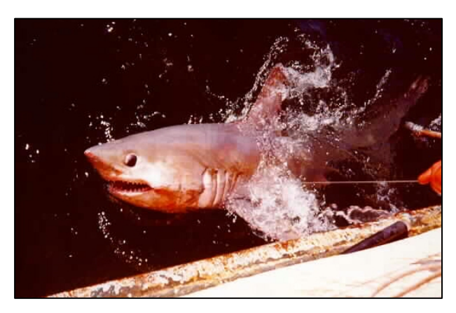
Porbeagle shark caught on commercial longline gear during a NEFSC charter cruise.

A study on the habitat utilization, movement patterns, and post-release survivorship of porbeagle sharks captured on longline gear in the North Atlantic was funded by the University of New Hampshire Large Pelagics Research Center's External Grants Program. This work is in conjunction with scientists from MDMF and the University of Massachusetts. The primary objective of this research is to deploy PSAT tags to examine the migratory routes, potential nursery areas, swimming behavior, and environmental associations that characterize habitat utilization by porbeagles. In addition, information will be obtained to validate the assessment of the physiological effects of