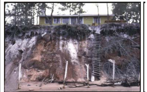
A bluff sediment bank is actively eroding due to the sand composition of the bluff.

Who: Local, state ,federal, resource managers