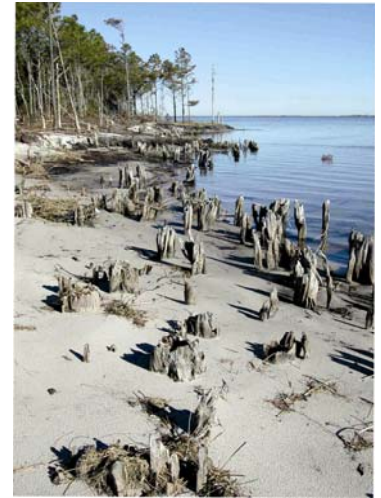
Eroded low sediment bank shoreline, NE shore of Cedar Island Bay

An ecological forecast that is readily usable by resource managers will aide formulation of effective strategies for preventing, mitigating, and adapting to the effects of global change.