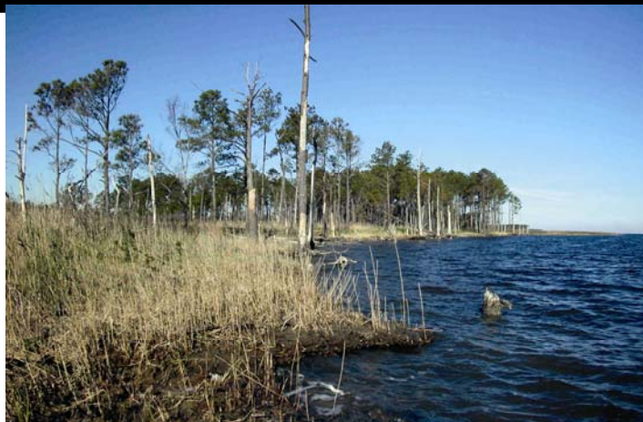
On the western Pungo River, the eroding platform marsh (foreground) is undercut, while the receding low sediment bank (background) leaves a trail of dead pines in the encroaching water

Coastal managers must plan for the effects of storm surge and sea level rise due to coastal subsidence and climate change. In 2002, NOAA engaged management assistance from the NC Division of Coastal Management to help plan a new research program to address problems faced by coastal decision makers in North Carolina due to sea level rise and storm surge. With guidance from the North Carolina scientific and management community in the major areas of research needed to help coastal managers mitigate the regional ecological impacts of sea level rise, NOAA held a workshop in Beaufort, NC February, 2004. Results from this workshop were invaluable in designing a research program to study potential ecological effects of projected sea level rise scenarios. Since Fall 2005, NOAA is working with university partners and state managers to create ecological models that will integrate with a NOAA physical model. Our research goals include development of decision making tools, maps and models useful to managers. In order to ensure that our end product serves the resource management community, NOAA is conducting manager's workshops to achieve management feedback.