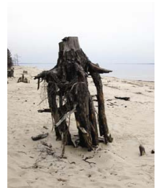
On the Neuse River estuary, The shallow lateral roots Show the former soil surface