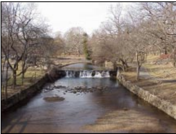
Peter Poncheri/Reading Public Museum

After more than 80 years of blockage, a river in Reading, Pa., is now two steps closer to returning to its natural free-flowing