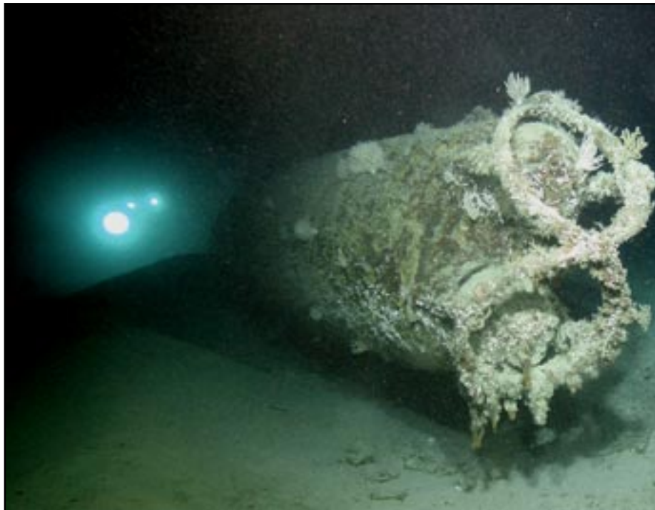
Terry Kirby/U. Hawaii

The agreement also signaled a role for NOAA as the lead agency in an inter-agency effort to protect and manage the historic wreck. continued on page 2