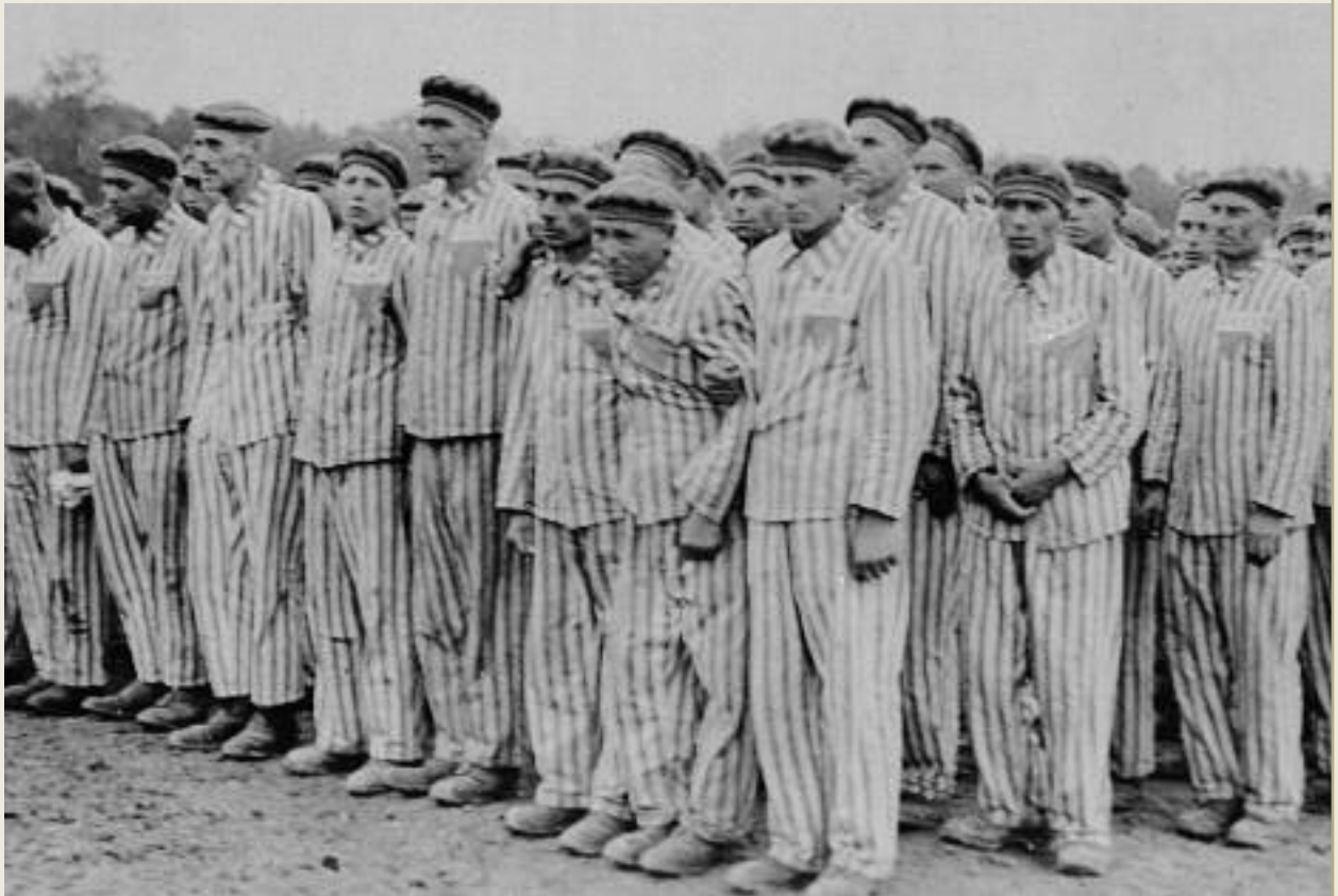
Prisoners stand during a roll call at the Buchenwald concentration camp in Germany. (ca. 1938–1941)