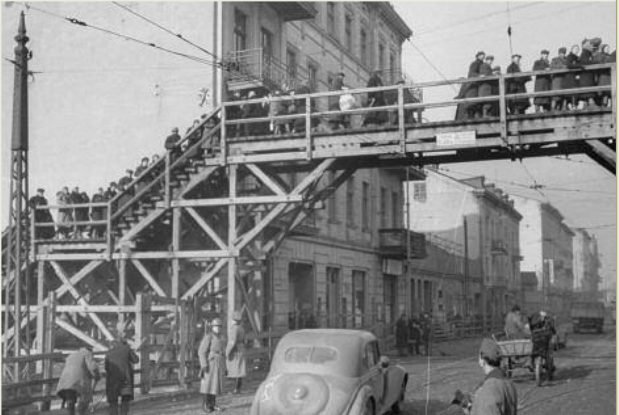
Jews cross a pedestrian bridge from one section of the Lodz ghetto (in Poland) to another. German guards control access to the ghetto from the street below—a main thoroughfare that is not part of the ghetto. (1941)