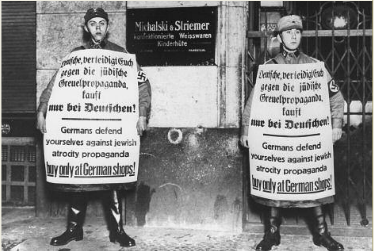
Two members of the SA encourage the boycott of Jewish-owned businesses. (April 1, 1933)