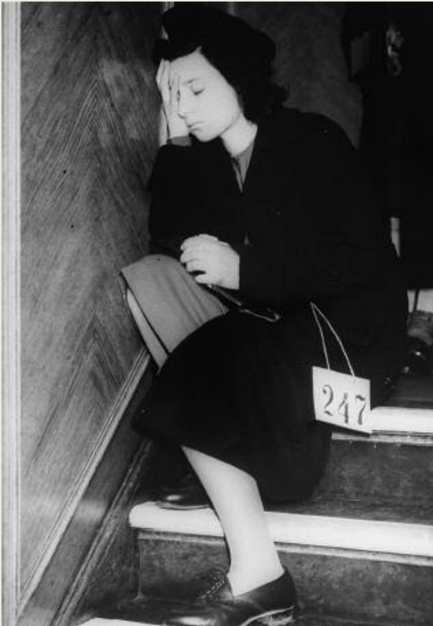
A Jewish girl from Vienna sits on a staircase after her arrival in England. Nearly 10,000 children found refuge in England in what was called the Kindertransport. (December 12, 1938)

U.S. National Archives and Records Administration