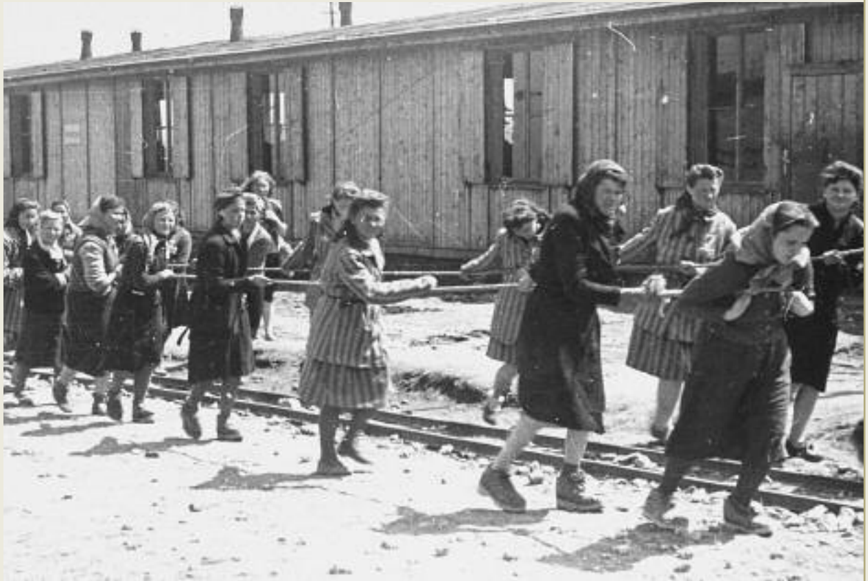
Prisoners perform forced labor in the Plaszow concentration camp in Poland. (ca. 1943-44)