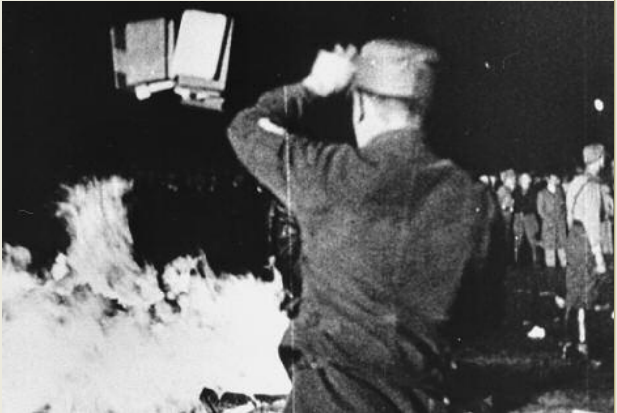
A member of the SA throws confiscated books into a bonfire during the public burning of "un-German" books in Berlin, Germany. (May 10, 1933)