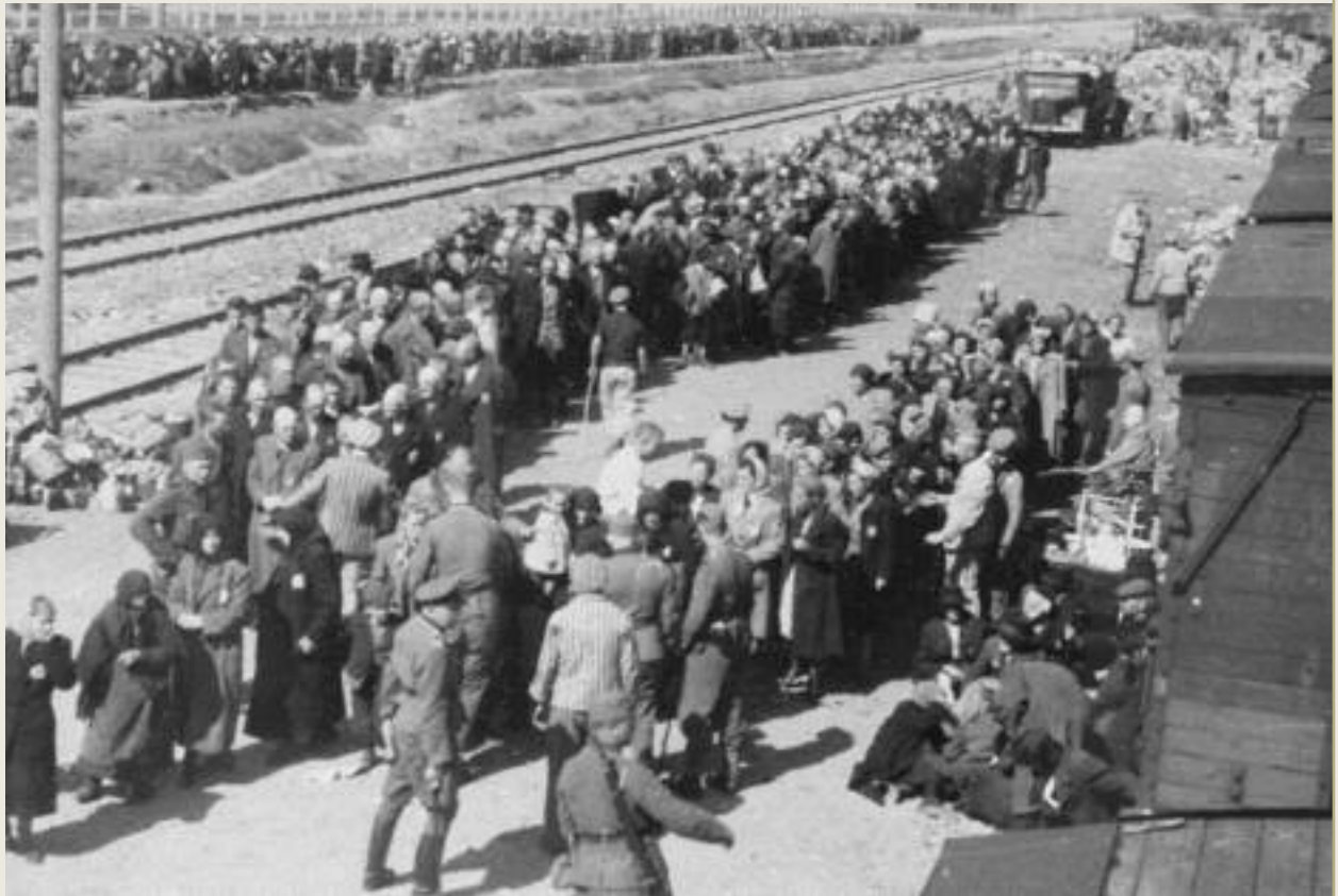
Members of the SS separate Hungarian Jewish men from women and children upon arrival at the Auschwitz-Birkenau killing center in Poland. After separating the victims by gender, the SS selected individuals for either forced labor or murder in gas chambers. (spring 1944)