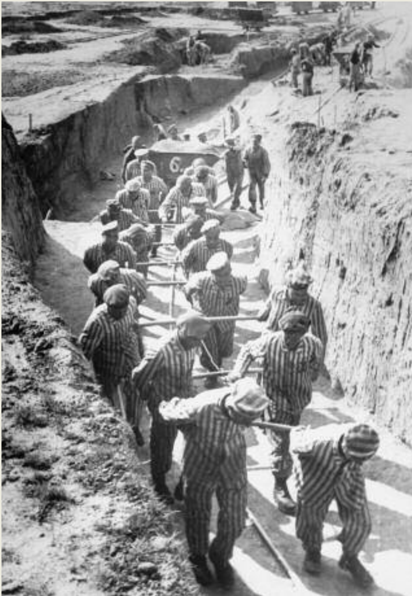
Under SS guard, prisoners perform forced labor in the Mauthausen concentration camp in Austria. (1942)

U.S. National Archives and Records Administration