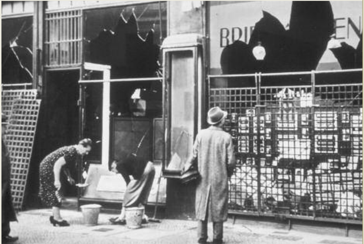
These shops in Berlin were among more than 7,000 Jewish-owned businesses that were vandalized in anti-Jewish riots known as Kristallnacht ("The Night of Broken Glass"). (November 10, 1938)