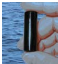
Figure 1. Internal fish tag

You will know if you've caught one of these fish because it will also have an external tag (Figure 3) attached near its dorsal fin (Figure 4).