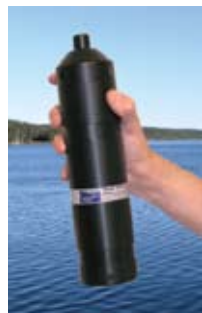
Figure 2. Acoustic receiver