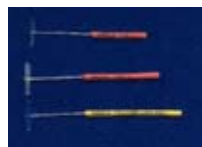
Figure 3. External tags - each fish will have one of these attached near their dorsal fin

If you capture a snapper or grouper with one of these external tags, and it is alive, please return it to the water so that it can continue providing data! If you can, please note the tag number and location of capture/return and call 912-598-2345 to report the