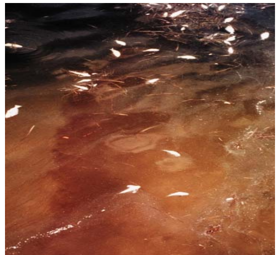
NOAA supported researchers are investigating how to predict and mitigate HABs, such as this Florida red tide event.

Some blooms, such as the persistent blooms along the western Florida coast in 2005, produce toxins that cause illness in humans and marine life, including respiratory distress in beachgoers. Other blooms reach such a large size that the decay of the algae robs the water of all oxygen, resulting in hypoxic "dead zones" in the bottom of estuaries and coastal environments and subsequent death of marine animals. The annual Gulf of Mexico hypoxia event at the mouth of the Mississippi is perhaps best known, but sporadic events can also be devastating, such as the hypoxia on the west Florida coast in 2005 that killed large expanses of coral reefs, benthic organisms, and fish that could not escape the area.