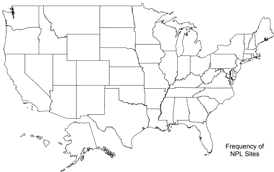
Figure 6-1. Frequency of NPL Sites with Chlorine Dioxide and Chlorite Contamination