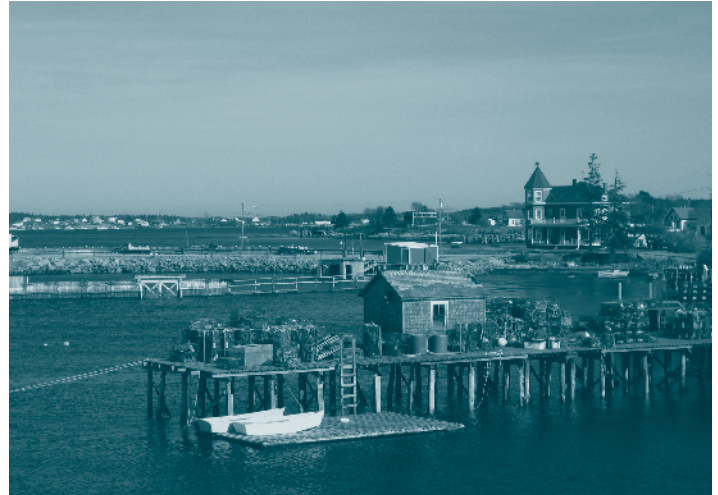
A pier crowded with fishing gear, Beals Island, Maine

Multiple factors have led to reduced commercial fishing in this region over the past twenty years including stock depletion, changes in fishing regulations, and pollution. Loss of commercial fishing infrastructure to alternative uses also increasingly constrains commercial fishing. All these factors are changing the nature of fishing communities. Gentrification and tourism are factors in communities such as Chatham, Marblehead, and Scituate, Massachusetts; Stonington, Connecticut; Little Compton, Rhode Island; and Vinalhaven, Maine. Many processors and fish houses have ceased operating in the last decade and most rely on imported rather than local product. A recent buyout of the last herring and sardine cannery left in Maine, a plant in Corea, (a village within the town of