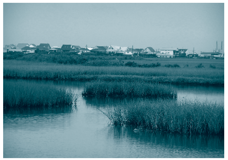
Houses near marshy waters, Grand Isle, Louisiana

In the aftermath of the storm, Mississippi changed its laws to allow casinos to be built on land within 800 feet of the