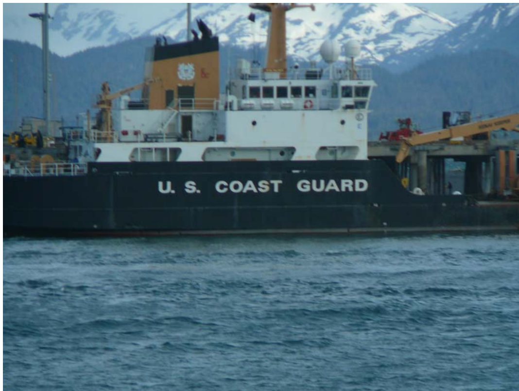
U. S. Coast Guard Ship docked in the Deep Water Dock of the Homer Spit.

I have already seen some gorgeous scenery, including the Canadian Rocky Mountains, Glacier Bay National Park, Anchorage, and Homer. The flight into Homer was a bit bumpy on such a small plane. There were maybe 15 passengers! I saw a moose as we arrived in Homer in some swampy waters near the coast - no antlers though. The Homer Airport reminded me of my hometown Thomasville Airport - VERY SMALL! The land here is much different than at home. The coast, a sheer drop off from the above plateau, has very muddy "beaches." From the airport, I got a ride with some other scientists boarding the FAIRWEATHER to the Homer Spit. This is the pier where many boats are docked and people camp and vacation. Apparently there is a strip of stores further down the pier - yes, it includes a McDonalds! As we drove into the Deep Water Dock where the ship was located a huge cruise dwarfed the image of the FAIRWEATHER. There was also a US Coast Guard ship at the same dock. Take a look at the pictures below of what I saw on the Deep Water Dock!