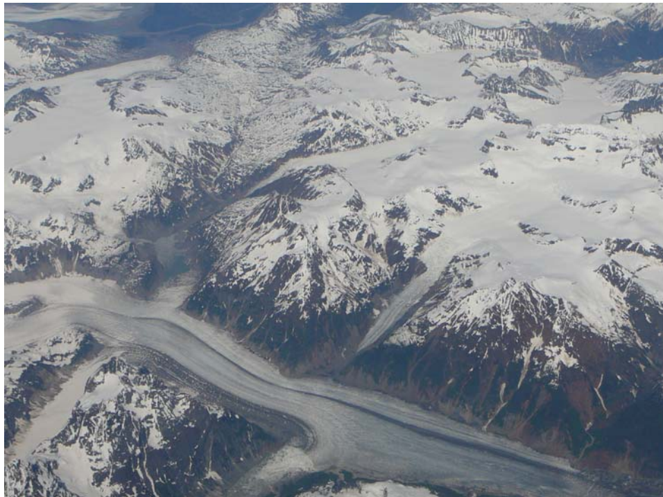
Glacier Bay National Park, AK