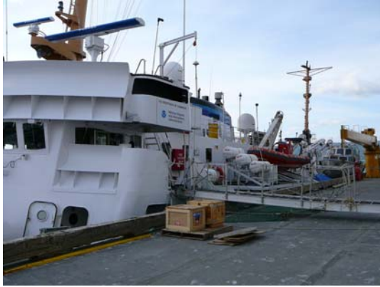
As I prepared to board the ship I quickly snapped a picture of the ramp up to the NOAA ship FAIRWEATHER.