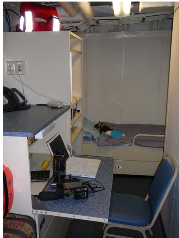
My Stateroom SR C-05-106

The flight across country was long and exhausting. I realized that I would be adding four hours to my day and be very tired if I stayed up late. I retired in my stateroom at about 9:00 pm Alaska time, 1:00 am Pennsylvania time! What a way to start summer vacation! The noise while I slept was deafening, but I was so tired I didn't move until my trusty alarm went off at 7:00 am today. I headed to breakfast and the start of my day!