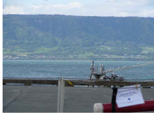
View off the end of the Deep Water Dock looking towards the Homer Airport up on top.