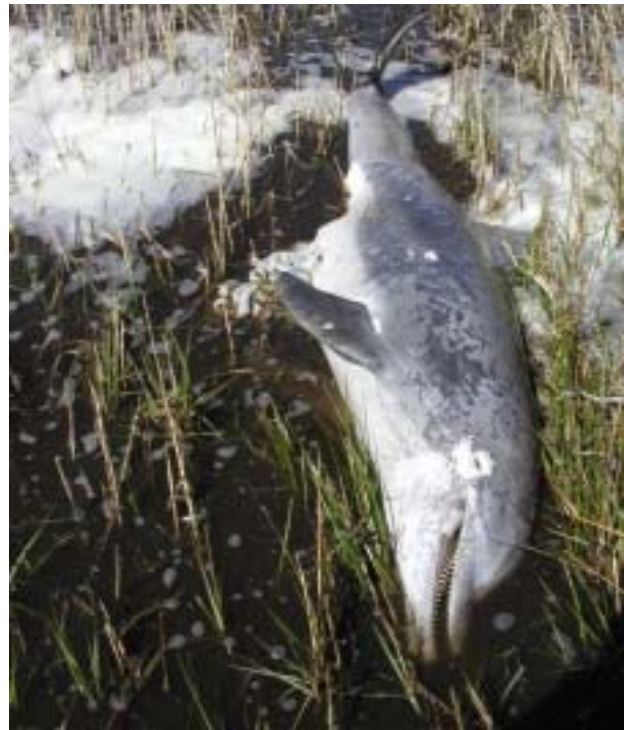
In the Florida event, NOAA/NCCOS scientists found high levels of brevetoxin in stomach contents.

NOAA's unique event-mortality analysis capabilities have even proven critical in addressing such events overseas. Russia's Shirshov Institute of Oceanology, for instance, has worked with NOAA to investigate a coastal region prone to outbreaks of