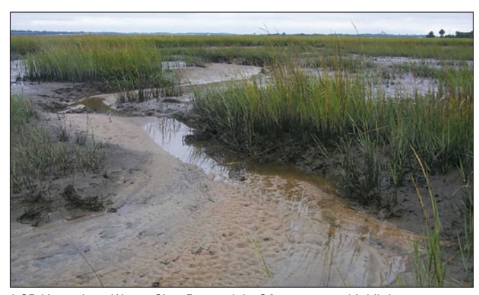
LCP Hazardous Waste Site, Brunswick, GA - see case highlights.