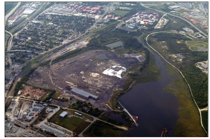
MacAlloy Corporation, Charleston, SC - see case highlights.