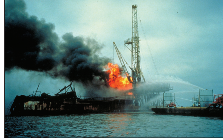
Greenhill, Terrebonne Parish - see case highlights.