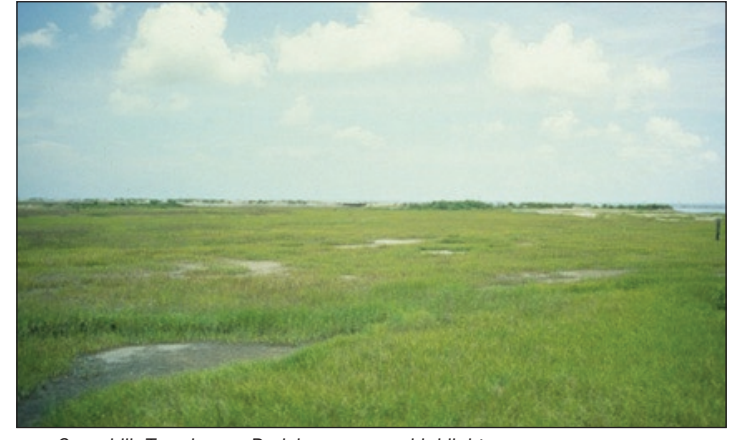
Greenhill, Terrebonne Parish - see case highlights.