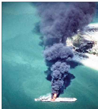
Vessel collision resulting in the Tampa Bay Oil Spill.