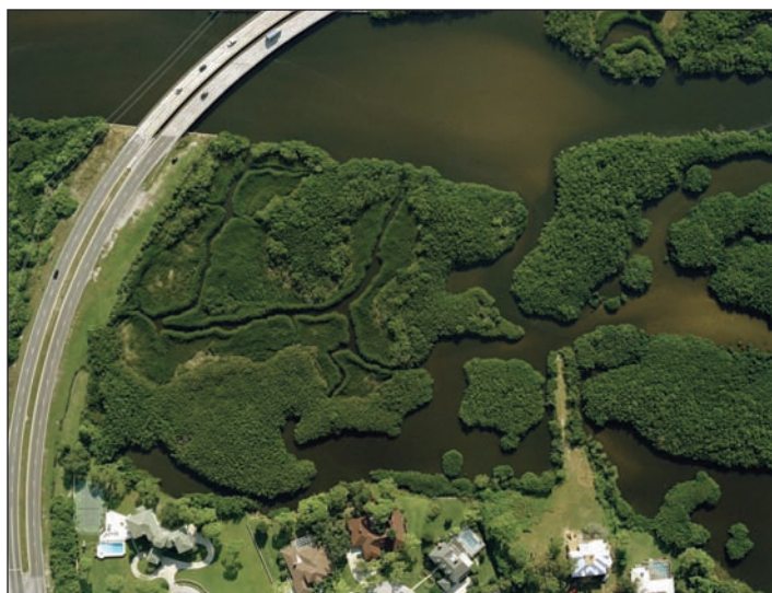
10 acres of mangrove habitat were restored as compensation for injuries resulting from the Tampa Bay Oil Spill.