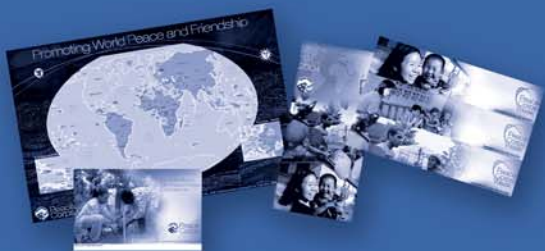
Peace Corps Week 2004 presentation kit materials

The Peace Corps is pleased to have Volunteers working in 71 countries and is preparing to open or reopen programs in several additional countries in 2003.