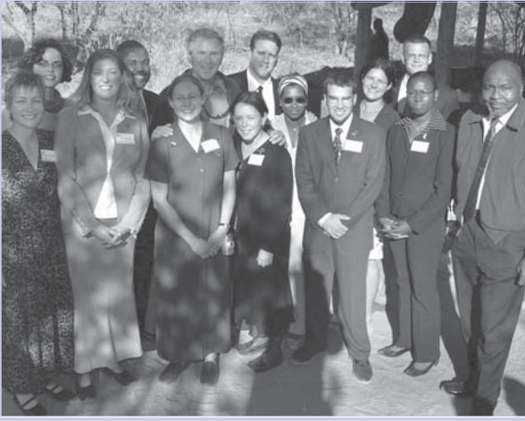
Volunteers had some private time with President Bush during his recent visit to Botswana. The president greeted and thanked each Volunteer personally for their efforts.