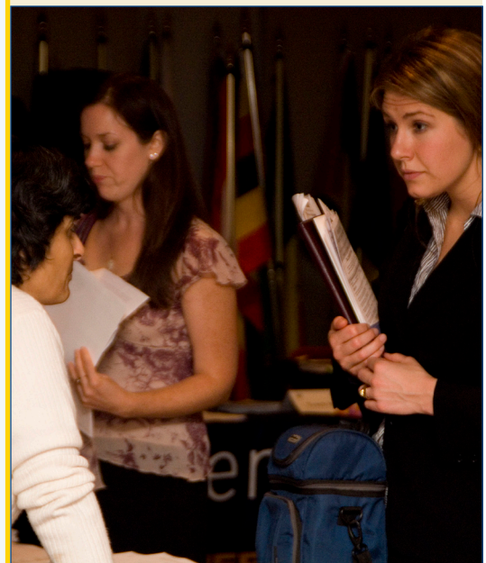
Approximately 150 RPCVs attended the September Career Fair.

If you missed our most recent event, mark your calendars: the next RPCV Career Event is scheduled for December 3–4. For more information, be sure to visit www.peacecorps.gov/rpcv/events (updated regularly).