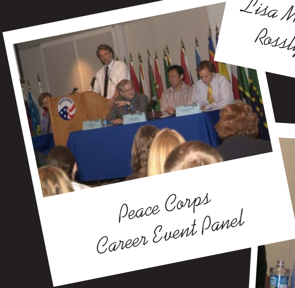
Peace Corps Career Event Panel