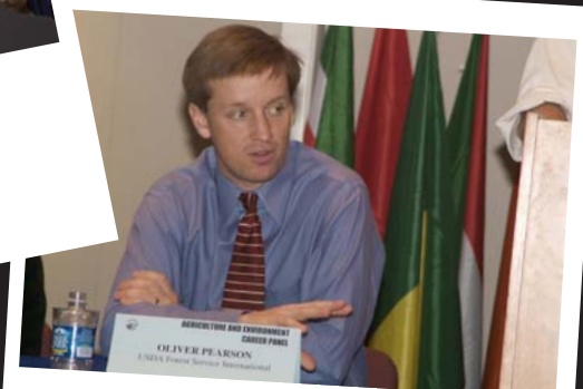
Agriculture and Environment Panelist