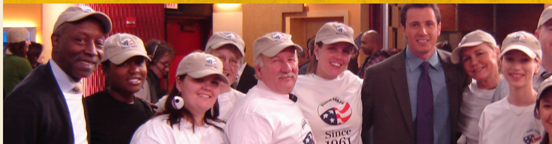
RPCVs and New York Regional Office Staff with Chris Cuomo at Good Morning America in NYC's Times Square.

Peace Corps Week is traditionally viewed as a grand occasion to commemorate the anniversary when President John F. Kennedy signed the Executive Order to establish the Peace Corps on March 1, 1961. Each year around the week of March 1, this milestone is celebrated by the Peace Corps community as they formally promote the Peace Corps by sharing personal stories of their overseas experiences with members of their communities. For this reason, Peace Corps Week is also seen as an ideal time to engage in the third goal—helping promote a better understanding of other peoples on the part of Americans. Formality aside, Peace Corps Week is simply the perfect occasion to relive your Volunteer service memories and to put it into perspective as you readjust to life back home in the United States. This Peace Corps Week, which fell on February 26 through March 4, 2007, was a huge success thanks to more than 3,900 registered RPCVs and other members of the Peace Corps family across the nation.