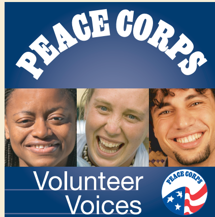
Volunteer Voices are podcasts of stories written and read by returned Peace Corps Volunteers.