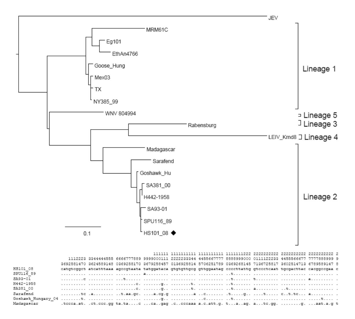
Figure 3. Maximum-likelihood analysis of the E-protein region of a West Nile virus isolate, HS101_08 (black diamond), recovered from horses in 2008 compared with isolates obtained from humans and animals from South Africa and other regions of the world. Nucleotide differences between lineage 2 strains included in the alignment are shown in the summarized alignment below the tree, indicating only unique nucleotides. Vertical numbers above the alignment indicate the position of each variable site on the gene fragment.