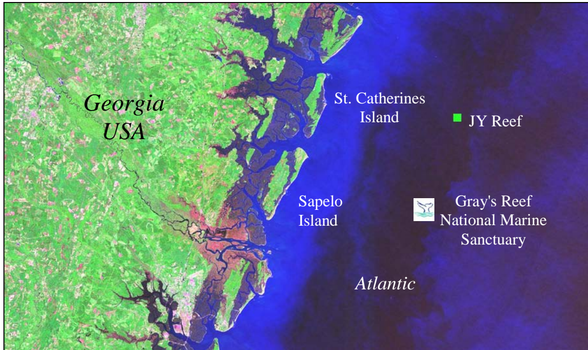
Figure 1. Study area offshore Georgia, USA

mostly comprised of large, coldwater scallops ( Placopectin magellanicus ) that once thrived offshore Georgia between 32,000 and 40,000 ybp (Garrison et al , 2008). Structurally, the shell bed at JY reef is considerably less stable than the outcrops at GRNMS. The shell bed is lightly cemented from the seafloor down to approximately 0.3 to 0.5 m after which it is more readily eroded. Bottom currents sweeping along the reef have undercut the softer layers of the shell bed leaving the harder cemented shell bed as exposed ledges. It is not uncommon to find sections of ledges that have broken and fallen to the seafloor.