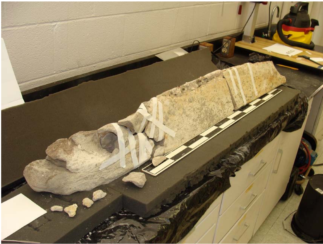
Figure 3. Whale bone dry-fitted for identification.

As soon as the whale bone arrived in Athens, the fragments were placed in fresh water to dissolve the chloride salt crystals from inside the bone. The fragments were soaked for approximately two months with the water periodically replaced before being removed and laid out to air dry. Once dried, the bone fragments were assembled (Figure 3). Since the bone had been well preserved and held in place by the surrounding sediment, most of the pieces had a very good fit. The recovered bone measured 1.5 m in length and weighed approximately 22 kg. It was clear that the bone was that of a baleen whale mandible, but further investigation would be required to determine the species. Pictures were taken of the mandible and sent out to cetacean experts for review.