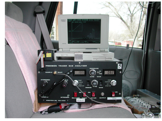
A fast response analyzer that measures tracer concentrations every second. The analyzer is easily carried in the back seat of a vehicle.

The SF<sub>6</sub> analyzers include a computer controlled calibration system and an integrated global positioning system (GPS) that tags each data point with sampling time and location. The systems can be used in cars, boats, aircraft, and buildings. The current configuration easily sits in an automobile or aircraft passenger seat and attaches with standard seat belts.