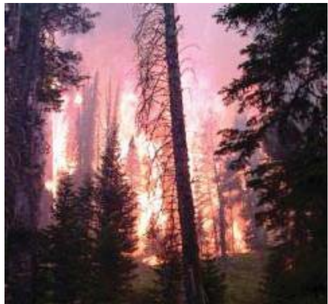
Forest fires release smoke and gases and chemicals, such as mercury, into the air.

ARL monitors and models air quality and deposition of pollutants to the Earth's surface to enhance assessments of changes in the atmospheric environment and to improve predictions of such changes. A primary focus of ARL's air quality research is on understanding the interaction between the atmosphere and the underlying land and water surfaces and biological systems.