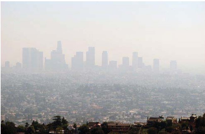
An example of poor urban air quality Los Angeles smog: Photo by Ben Amstutz

ARL conducts research and development in the fields of air quality, atmospheric transport and dispersion, and climate change. Key capabilities include the development, evaluation, and application of air quality models; improvement of approaches for predicting atmospheric dispersion of hazardous chemicals and materials; and improved measurements and understanding of the exchange of material between the air and Earth's surface and climate variability and trends.