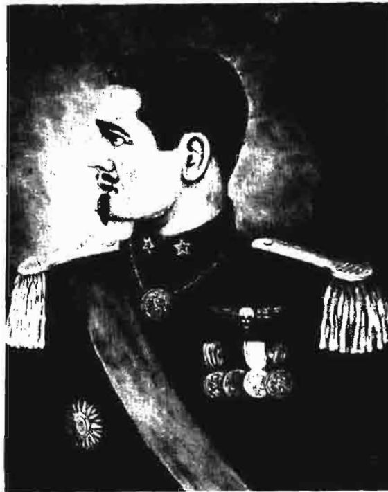
Salvo Salasio, ruler of Zendia.

The hundreds of graduates of the course can be found today in many areas in operations — in analytical and managerial positions — and in research and development. A number of them have reached positions of considerable responsibility.