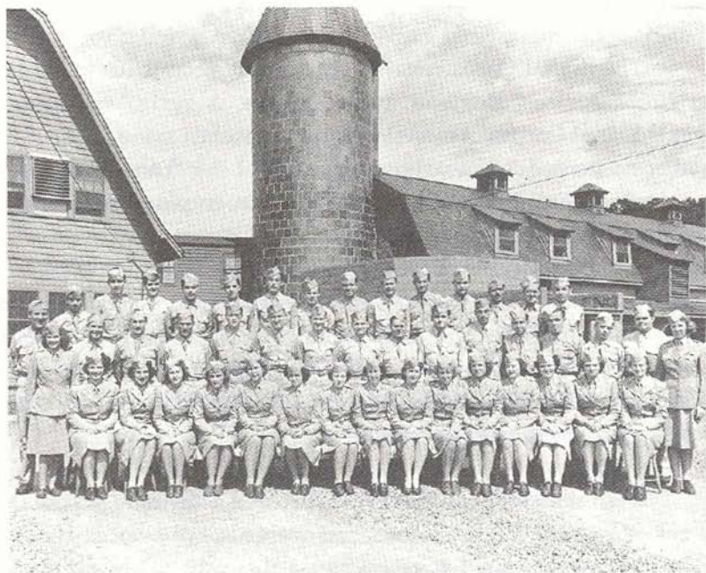
Operations trick, 2nd Signal Service Battalion (soldiers and Wacs), approximately 1943. The battalion was located in Vint Hill Farms Station, Virginia. (Note the barn in the background.)

Unlike many occupations women entered during the war, cryptology was never a traditionally male job. Since the beginning of permanent cipher bureaus following World War I, women civilians had worked in the Army and Navy code rooms. There were other positions in the intelligence field, however, that had always been filled by men, such as the radio intercept operators. Women proved repeatedly that they could do the work as capably as, and sometimes better than, the men they replaced. A WAC staff director, reporting on the Wacs in the Second Signal Service Battalion, said, "It was proven over and over again that women were far better equipped than men for routine but detailed work." 25