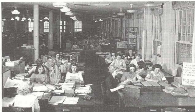
Codebreakers at work at Arlington Hall Station

Here men and women, civilian and military, worked to break the coded messages. Many had a background in mathematics. College graduates recruited locally and around the country applied their mathematical skills to the science of cryptology. The Navy's Enigma office (OP-20-GI-2(A)) was known as the "Office of College Professors" because many of the officers were Ph.D.'s and teachers. 18