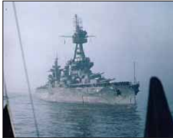
An old photograph taken of the USS New York (BB 34) during World War II.

"I caught up with one of my shipmates that I haven't seen since we walked off the ship in 1945," he continued. "I picked him right out of the crowd. There were several of