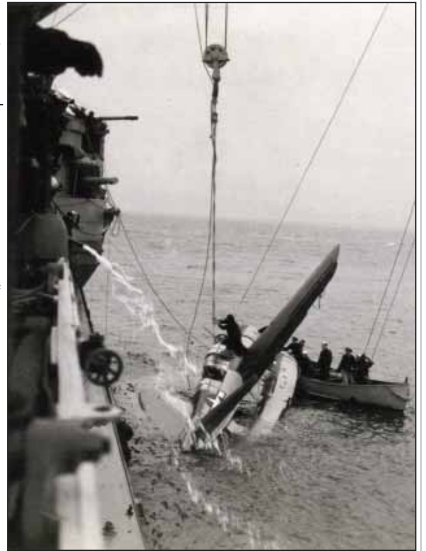
The crew of the USS New York (BB 34) pulls a downed aircraft from the water.

On Monday, March 3, before heading back to Washington, Mattox planned a stop by the Gulfport facility, to check on the progress of the construction. Just so happened, that was the day of the ground break-