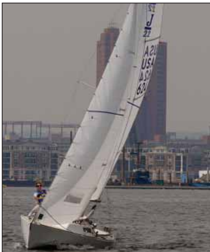
It was a perfect day for sailing and many residents enjoyed watching this sailboat from the harbor.