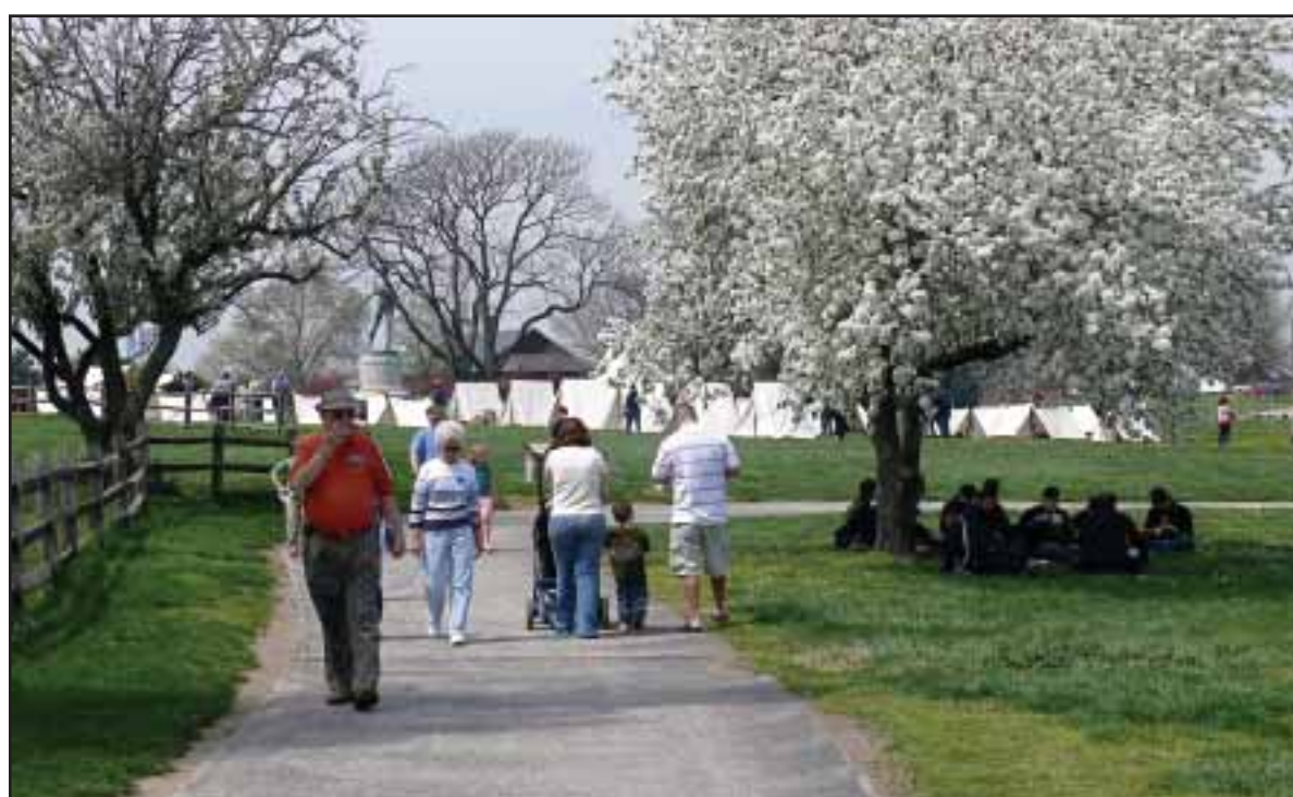
Tourists stroll along one of the sidewalks at Fort McHenry enjoying the beautiful landscape.