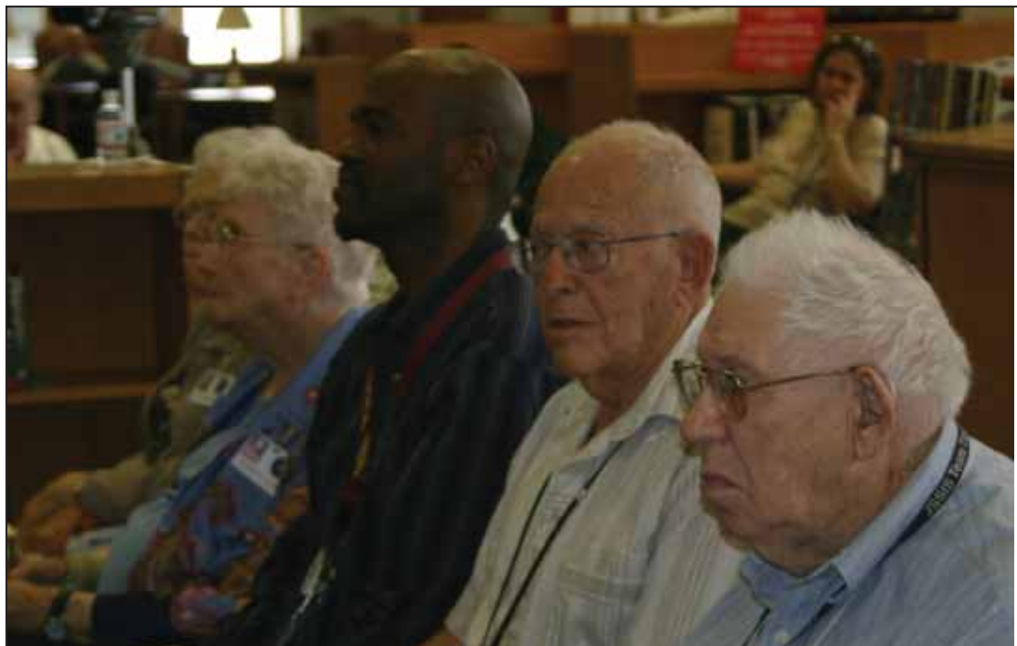
A group of residents listen as poems are read aloud in the AFRH library. The poetry reading was part of the 'Poem in Your Pocket' observance which was held on April 17.

had written. The library chairs were filled with residents as they gathered around to listen to the poetry.