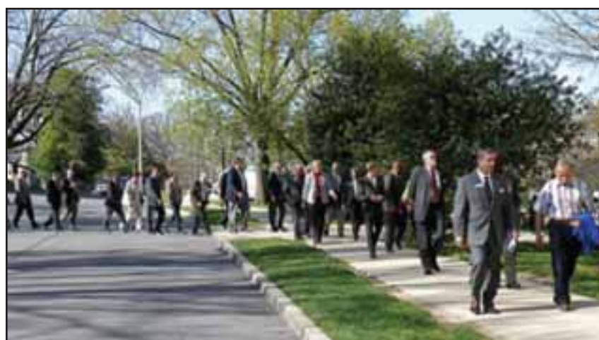
The SECNAV Retiree Council members on tour of the AFRH during a recent visit to Washington, D.C.

Members of the Navy's Retiree Council were in Washington D.C. the week of April 14-18 and made a stop at the AFRH on April 15 to tour the facility and visit with residents. While at the AFRH, the group received a walking tour of residential living areas (Sheridan and Scott building). The tour also included visiting the bowling center, wood shop, fitness center, and AAFES, ceramics, library, theater and wellness center. The final stop was at the dining hall for lunch with the residents.