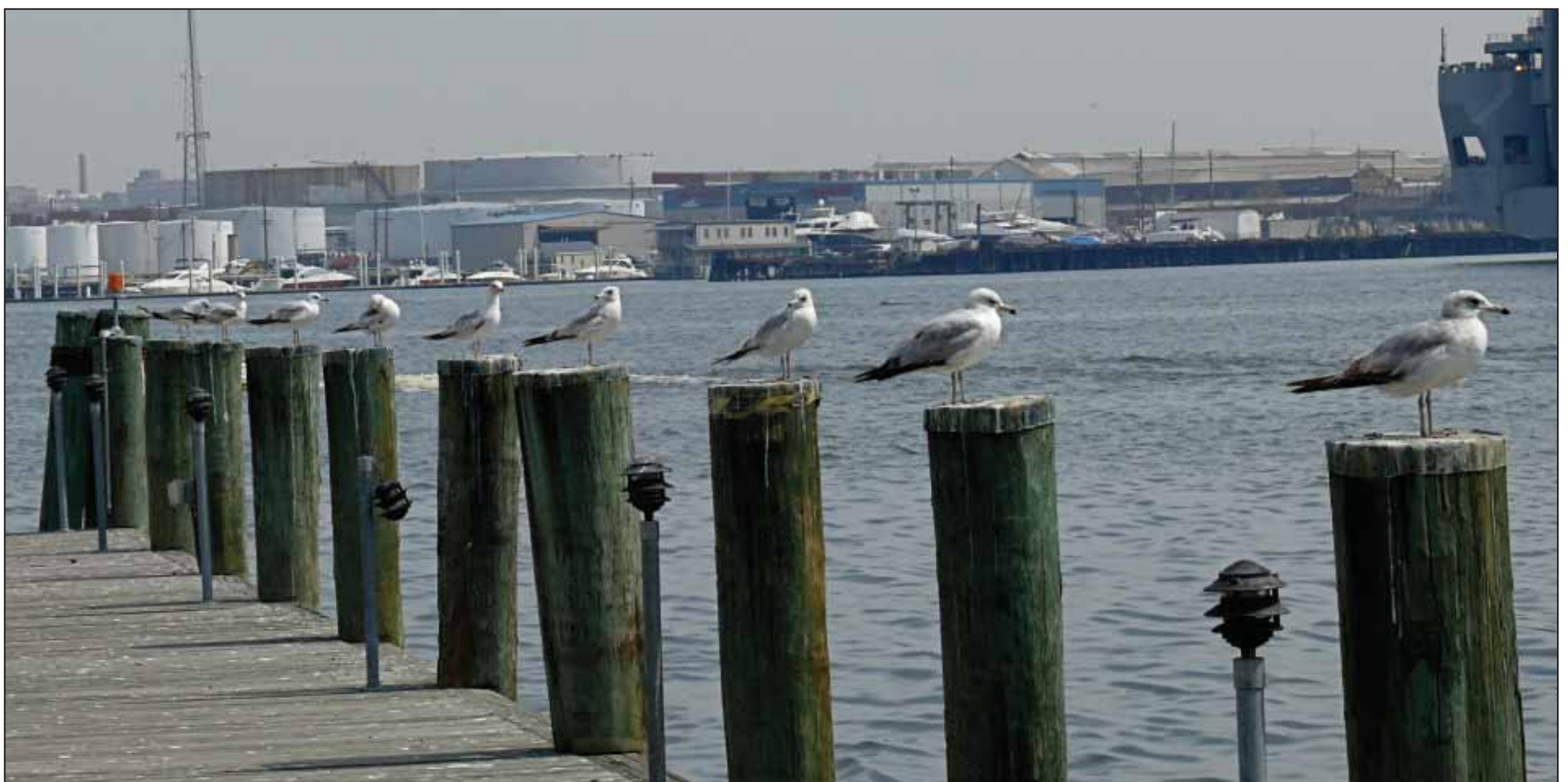
We all need our own space...seagulls enjoy a view of the harbor.