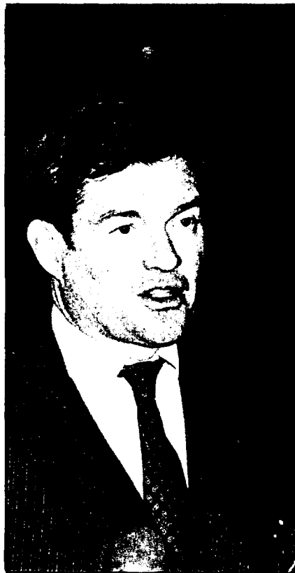
Christopher S. Bond

portation for the children in need. For example, if the child needs to go back to the hospital, the state will pay for the ambulance. The state will also pay for the homemaker or chore services to help the family with homemaking services, medical equipment and supplies, physical therapy, and pharmacy costs.