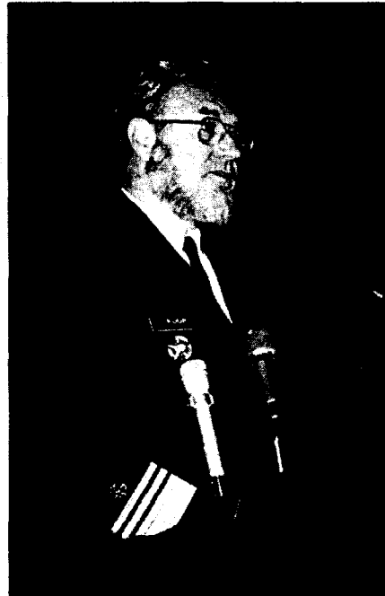
C. Everett Koop

At the close of last December's workshop, we affirmed our commitment to turn into reality as many of the workshop recommendations as possible. With us today are a number of the same people