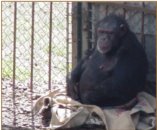
An example of a nest built by a chimpanzee in captivity (photo by K. Baker).