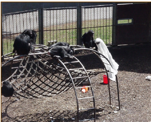
This enclosure provides multiple objects for enrichment to minimize aggression.

Even chimpanzees that know each other well may fight on occasion. Fights often look and sound worse than they are. Trying to stop a fight, for example, by spraying chimpanzees with water, will do no good and may make things worse. Separating them and keeping them alone for a while is also a bad idea. They will remember their dispute and may fight even worse once they are reunited. It