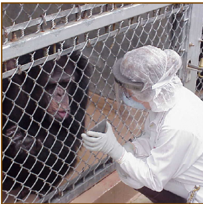
A hand-held mirror provides enrichment to chimpanzees, who are interested in their own reflections.

Chimpanzees should be housed in an environment that gives them adequate ventilation, shade during hot days, and heat during cold days. Providing a fresh flow of air is recommended if the temperature gets as high as 90° F. They may enjoy the flow of water from a sprinkler placed outside their enclosure so that part (but not all) of their housing area receives some cooling. Chimpanzees should never be exposed to temperatures below 50° F. Even at higher temperatures than this, they will need supplemental heat.