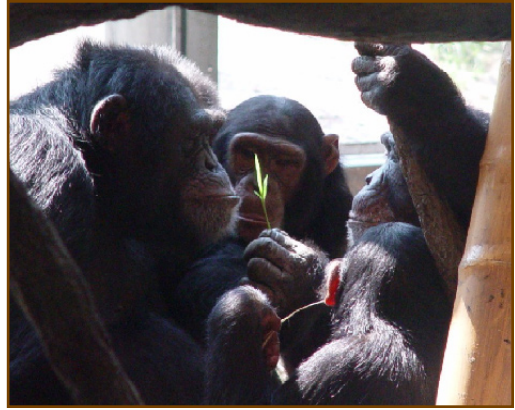
Social curiosity/learning.

Newly-introduced chimpanzees should be watched carefully for at least a week. It is important to keep things quiet and calm around them, since they will be more likely to attack each other when there is noise, commotion or a stranger nearby. If several chimpanzees are to be introduced into one group, it is best to introduce different combinations of pairs together over several days before putting everyone together. If a male and female are introduced to each other, the introduction will go more smoothly during the time of month when the female has a sexual swelling. The riskiest social introductions involve males meeting each other, or chimpanzees that were housed alone for long periods of time.