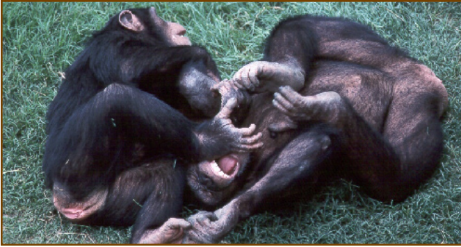
Chimps at play.

Displays are common when chimpanzees meet new chimpanzees or people and at the arrival of food. Sometimes chimpanzees will throw feces or spit on people during these displays. Reacting to such behavior (e.g., jumping away, yelling at the chimpanzee) will only encourage it. Walking away slowly or ignoring this behavior will discourage it over time.