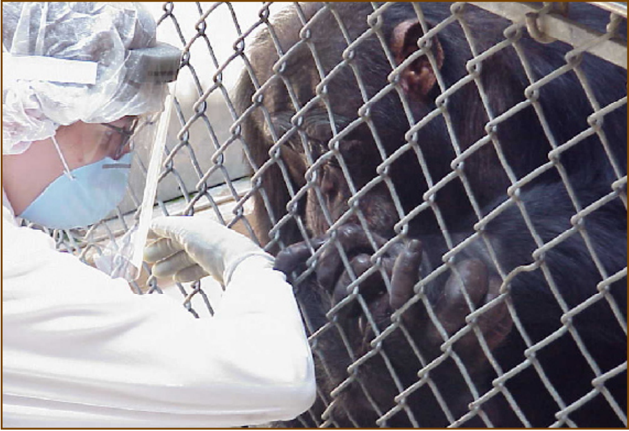
Human-chimpanzee interactions that permit limited contact in a safe manner can be achieved.