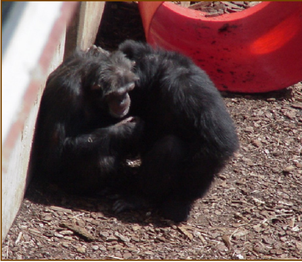
Chimps grooming.