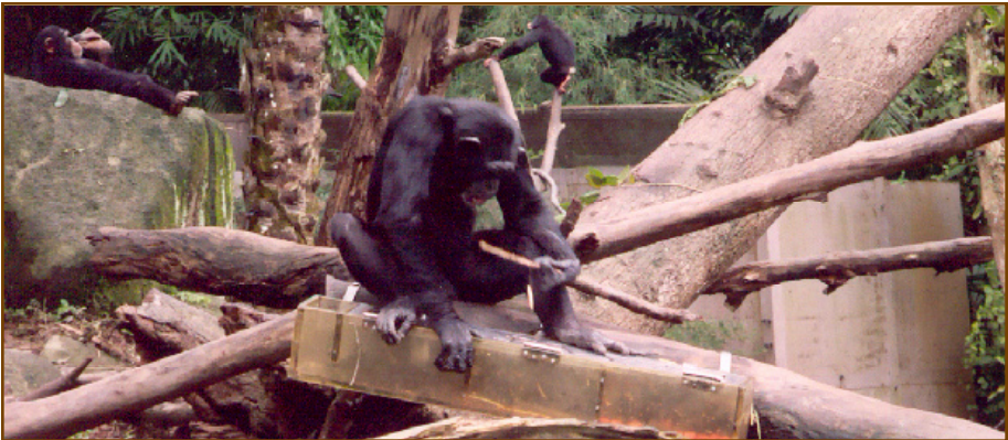
A food puzzle being used by a chimpanzee.

Chimpanzees like to destroy things. Giving them items they can safely wreck, many of which are free or very inexpensive, is a widely used way of entertaining them. A cardboard box can be played in, squashed, ripped, chewed, and finally used for nesting material. Long sheets of butcher paper are very entertaining (butcher paper is easier on drains and easier to clean up than newspaper). An empty plastic soda or milk bottle, perhaps containing a small food treat, pro-