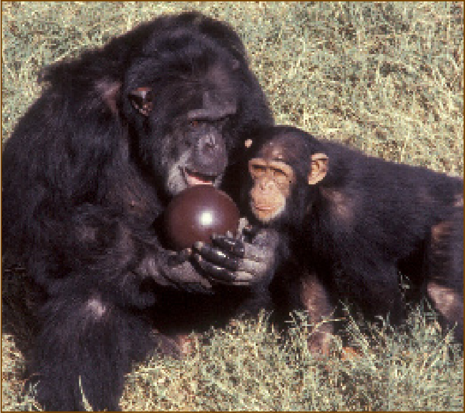
Tolerance of young animals by adult males (photo by M. Bloomsmith).

However, it is not always easy to form and maintain such groups. One must take great care in introducing unfamiliar chimpanzees to each other, keeping in mind that they are hostile to strangers in the wild. Several steps can be taken to make introductions go more smoothly. First, it is a good idea to let chimpanzees see but not touch each other for a short amount of time. Long periods of seeing but not touching, however, may make them more hostile to each other. Ideally, giving them a day or two of seeing each other should be followed by letting them touch each other but not enter each others' enclosure. This gives them a chance to meet each other and establish dominance more safely than suddenly putting them together in the same enclosure as complete strangers.