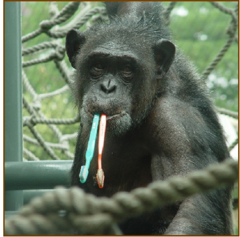
A chimpanzee manipulates objects provided for enrichment purposes. As always, caution must be exercised to ensure animals are not harmed by the enrichment devices.

Chimpanzees are extremely intelligent and will benefit from problem-solving and other mental activities. Inexpensive puzzles and projects can be made out of materials available at a home-improvement store. Even something as simple as a piece of polyvinyl chloride (PVC) pipe smeared on the inside with peanut butter, along with a stick or narrower piece of pipe to insert to get at the food, makes a pleasant diversion for chimpanzees. A PVC pipe drilled with a few finger holes and containing a frozen banana is another easy idea. Other safe and effective puzzles are described on the internet (see online resources listed at the end of the chapter.). Many chimpanzees enjoy finger painting or drawing with nontoxic crayons. Finally, training is great stimulation for the smart mind of a chimpanzee and is fun for people as well.