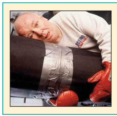
4.5" x 2"

A message from the National Diabetes Education Program, sponsored by the National Institutes of Health and the Centers for Disease Control and Prevention