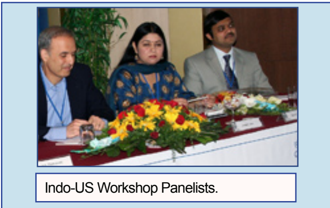
Indo-US Workshop Panelists.

The National Digital Information Infrastructure and Preservation Program was well represented at the Indo-US Workshop on International Trends in Digital Preservation held in Pune, India on March 24-25, 2009. Workshop objectives included learning from the experiences of other nations and developing a strategy for implementing the Indian National Digital Preservation Programme .