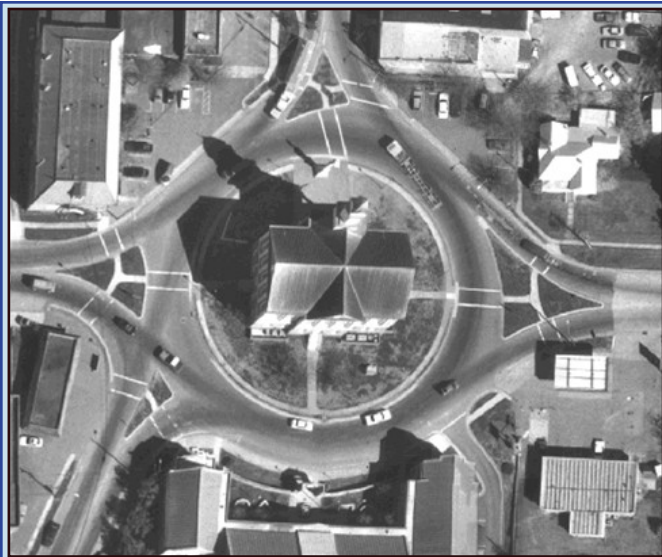
Downtown Pittsboro, North Carolina, U.S.A., from the 1997 Chatham County North Carolina digital orthophotography capture.

Numerous points social and physical information are tracked over time with geospatial data, like the erosion of a coast line or the shape of commercial development in a particular area. This specialized data is used by national and local governments and is an important part of the public record. The Library of Congress is supporting several efforts to preserve geospatial data and on April 21 sponsored a day-long tutorial called “Preservation Issues Related to Digital Geospatial Data.”