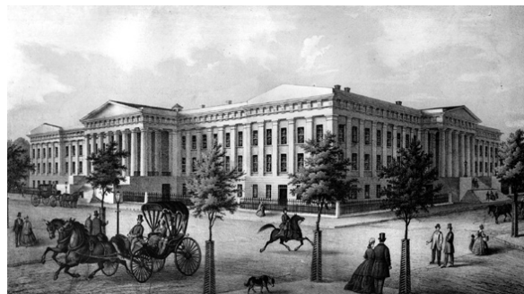
The first Interior building, 1852-1917. The building, located on F and 8th Streets, NW, Washington, D.C., today houses the Smithsonian's National Portrait Gallery. For more on the history of the Department of the Interior, see the report, "The Department of Everything Else: Highlights of Interior's History" on-line at http://www.cr.nps.gov/history/online_books/utley-mackintosh/index.htm .

Each of our eight bureaus—the Bureau of Indian Affairs (BIA), the Bureau of Land Management (BLM), the Bureau of Reclamation (BOR), the U.S. Fish and Wildlife Service (FWS), the Minerals Management Service (MMS), the National Park Service (NPS), the Office of Surface Mining Reclamation and Enforcement (OSM), and the U.S. Geological Survey (USGS)—has specific responsibilities for discharging our mission ( Figure 1-3 ). Departmental Offices, including those specifically mentioned in this report—the Offices of the Special Trustee for American Indians (OST), Insular Affairs (OIA), Inspector General (OIG), Law Enforcement (PLE) and Wildland Fire Coordination (OWFC)—support key Interior operations and help our bureaus carry out Interior's mission.